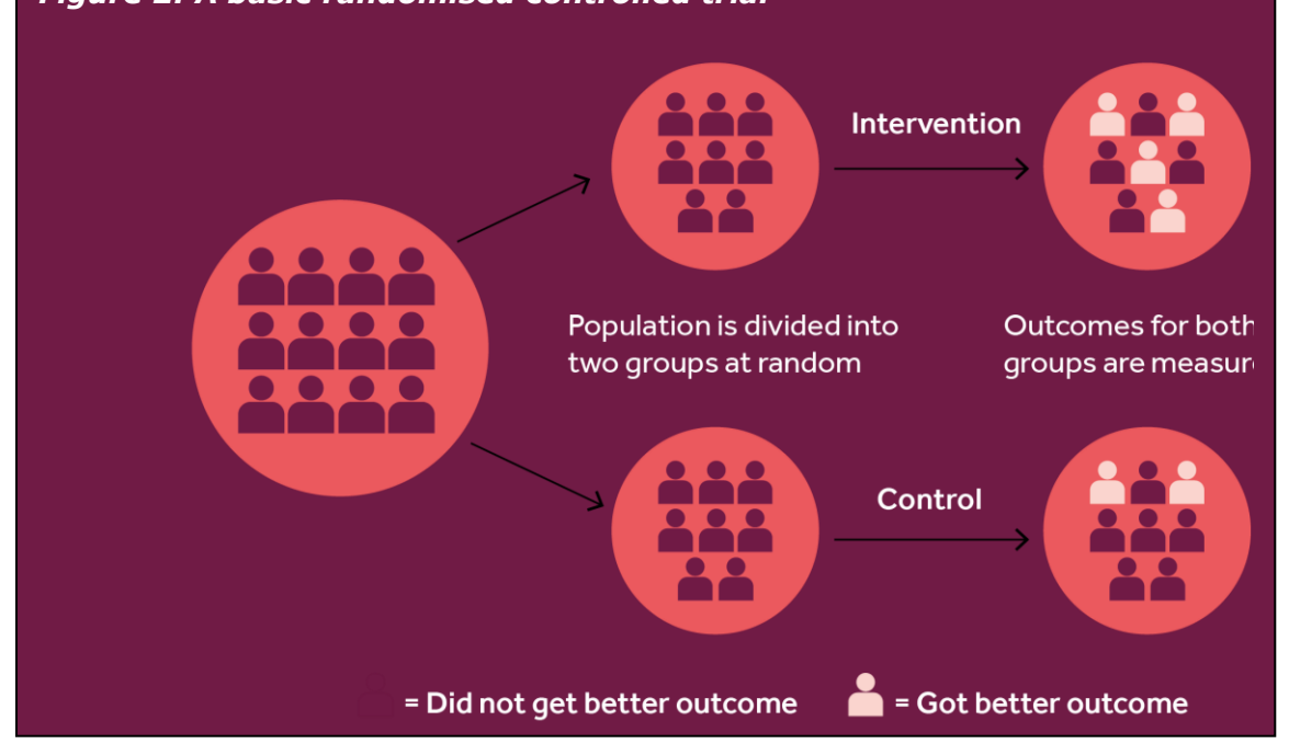
Figure 2: A basic randomised controlled trial

Randomised controlled trials (RCT), of which field trials are one type, help us to answer this. In an RCT, we divide the population to be tested randomly into two or more groups. One group receives service as usual (the control group) and the other receives the new intervention (the treatment group). Because the groups contain people who should be roughly similar to each other on average, we can then compare the difference in outcomes between the treatment and control group. This difference is a precise measure of causation, telling us exactly what effect our intervention has had.