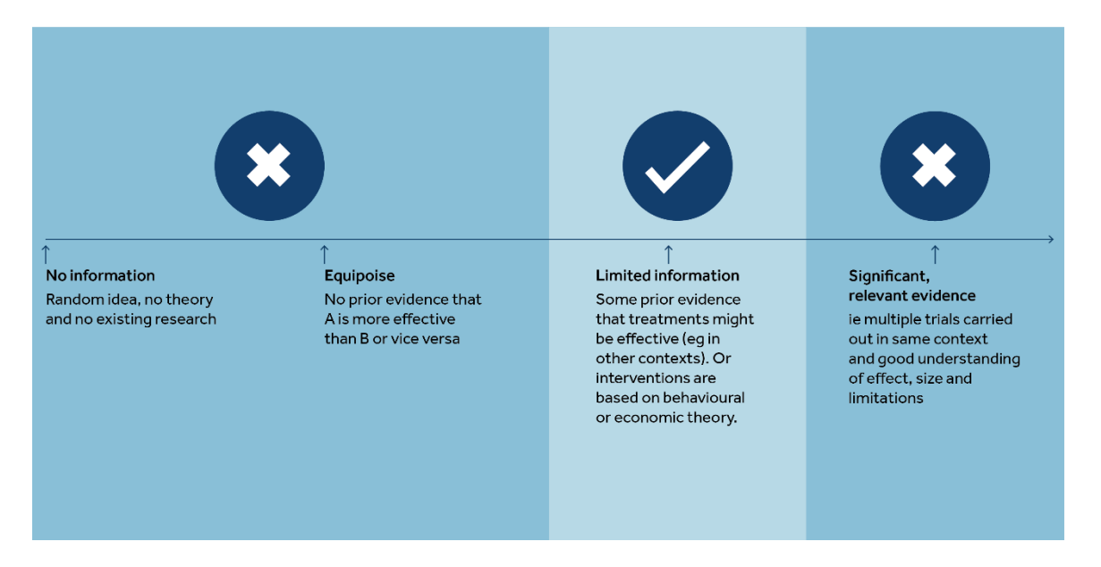
Figure 4: Spectrum of existing evidence

be unlikely to approve trials which test an intervention for which there is negative evidence, unless the intervention was current practice or agreed future practice and was to be tested as the control group against a new idea. However, we may consider trials which involve removing services rather than adding them if there is sufficient evidence that this would be unlikely to be harmful.